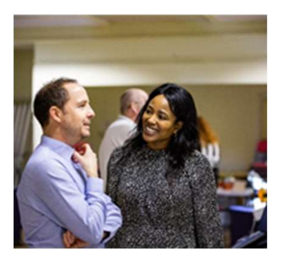
Local engagement team